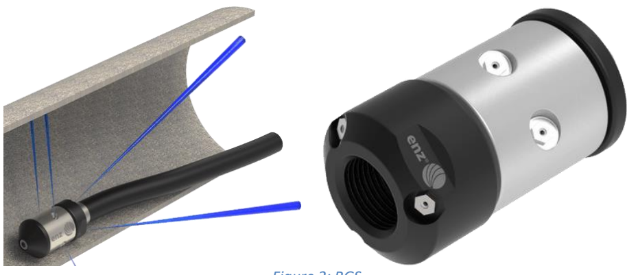
Figure 2: RGS