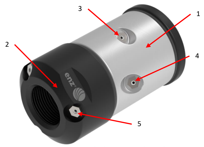
Figure 7: How standard rotating nozzles work

The rotor (1) is supported on the stator (2) through a thin water film. Standard rotating nozzles have four jets located on the rotor (1). The two drive jets (3) drive the standard rotating nozzle and the two brake jets (4) ensure constant rotation. The three thrust jets (5) move the standard rotating nozzle through the pipe and transport the dislodged deposits back to the manhole.