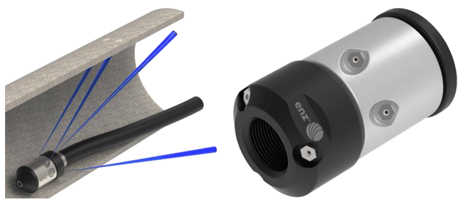
Figure 3: HRH