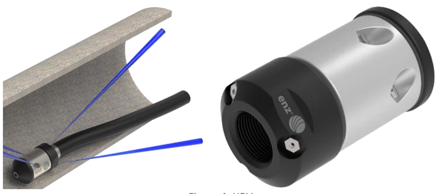
Figure 4: HRV